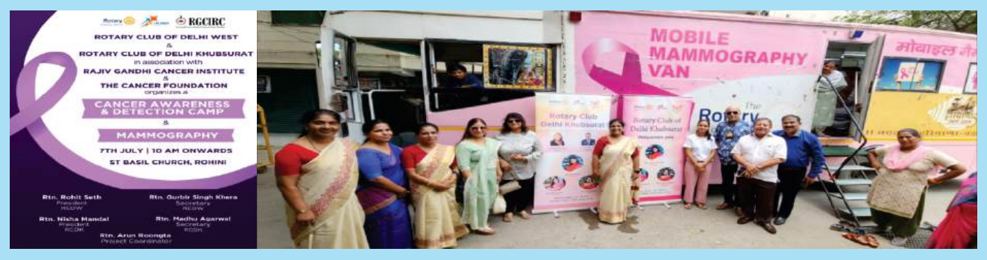
Rotary Club of Delhi West and Rotary Club of Delhi Khubsurat organised a Cancer Awareness and Detection Camp with Mammography at St Basil Church, Rohini.