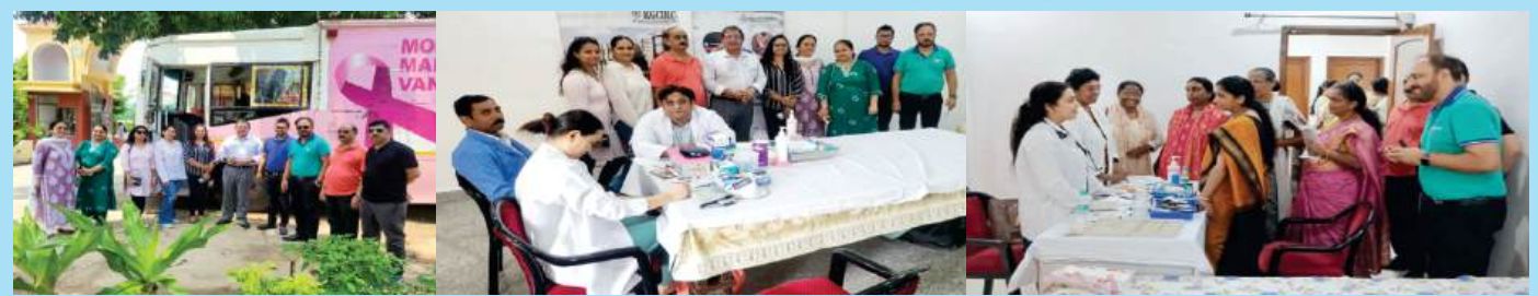
Rotary Club of Delhi West and Rotary Club of Faridabad Green organised a Cancer Awareness and Detection Camp with Mammography at Sector 9 Church.