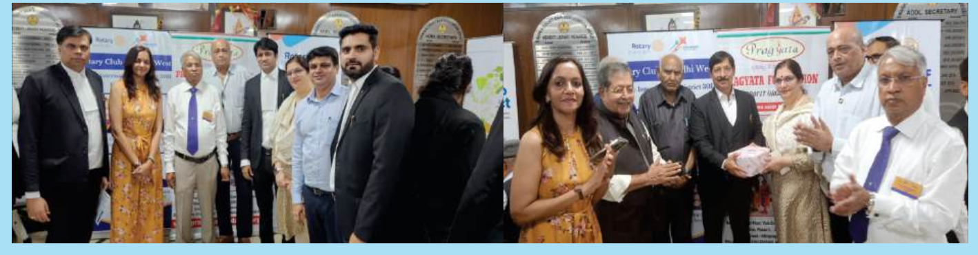
Pragyata Foundation, Rotary Club of Delhi West and Rotary Club of Delhi South West Organised a Mega Health Camp at Dwarka Courts Bar Association. More than 500 Lawyers took the benefit of these Medical Facilities.